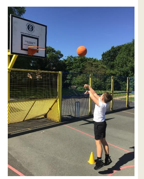
Learning how to play basketball and rugby